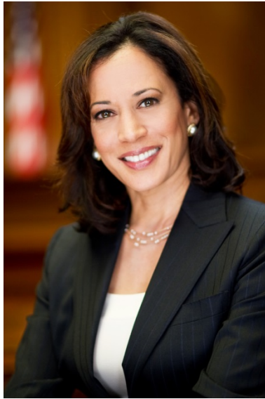
KAMALA D. HARRIS ATTORNEY GENERAL

As chief law officer of California, the Attorney General is responsible for ensuring that state laws are uniformly and adequately enforced. The Attorney General carries out this constitutional responsibility through the programs of the Department of Justice. The Attorney General's specific charges are threefold: to provide legal representation, to support common law enforcement, and to protect consumers and the environment.