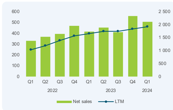
Net sales, quarterly and 12-month rolling, SEK million