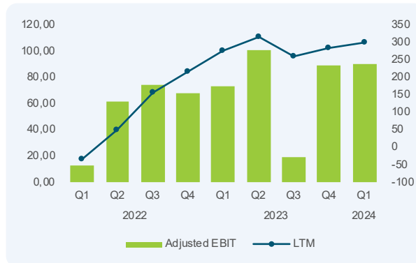
Adj. EBIT, quarterly and 12 months rolling, SEK million

72.9 percent (56.7) of net sales originated in Americas, 20.1 percent (34.1) in EMEA, and 7.1 percent (9.2) in Asia Pacific. All geographies and customer segments are developing well. We continue to see a strong interest from the financial services industry, the high-tech sector, and the European defence sector. Americas had a slow start of the last year and that region’s share of net sales was unusually low in Q1 2023. This explains the strong improvement for the region in Q1 2024 compared to same quarter last year.