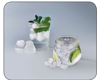
Dual Ice Maker with Ice Bites