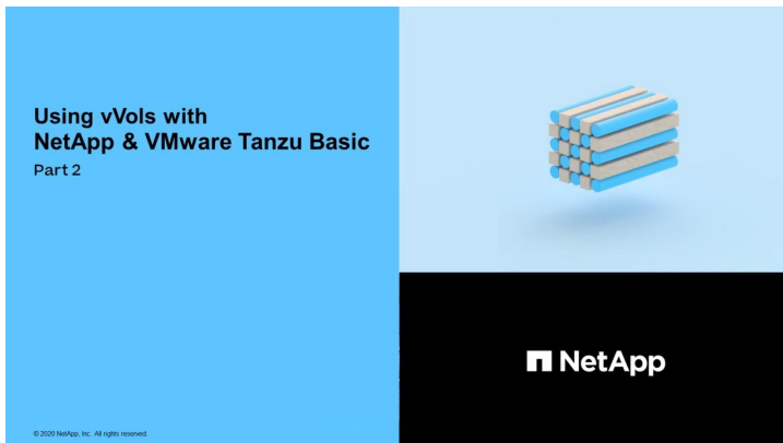
How to use vVols with NetApp and VMware Tanzu Basic, part 2