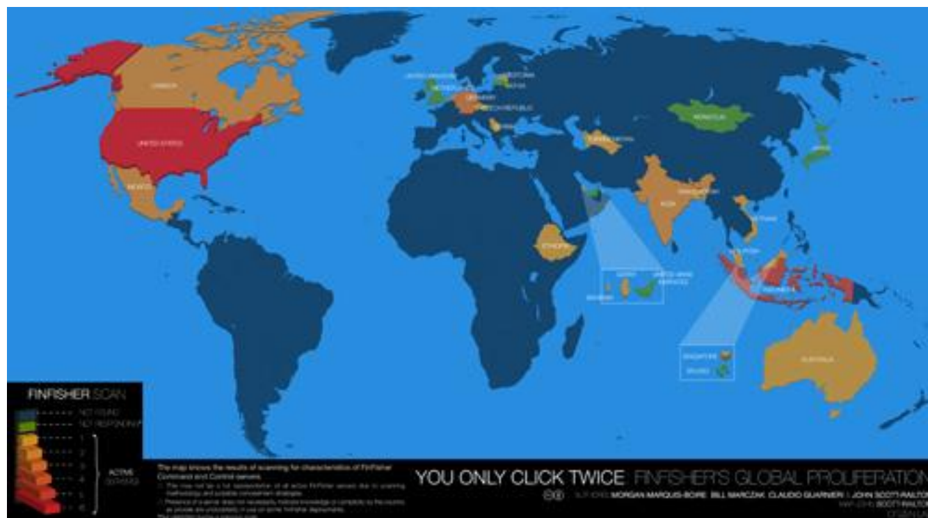
Figure 1. Map of global FinFisher proliferation

Around October 2012, we observed that the behavior of FinSpy servers began to change. Servers stopped responding to our fingerprint, which had exploited a quirk in the distinctive FinSpy wire protocol. We believe that this indicates that Gamma either independently changed the FinSpy protocol, or was able to determine key elements of our fingerprint, although it has never been publicly revealed.