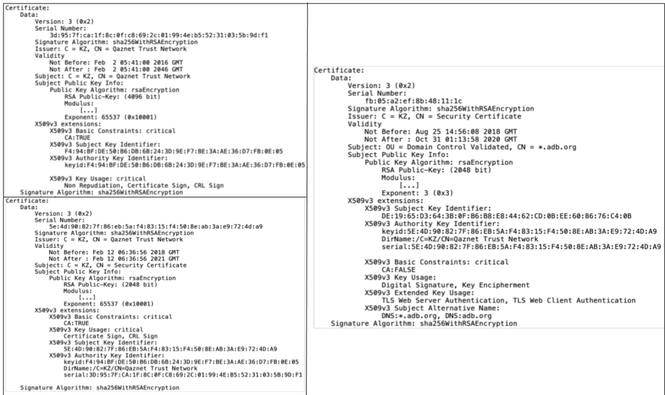
Figure 4: The certificate chain of Kazakhstan’s custom root. ◊