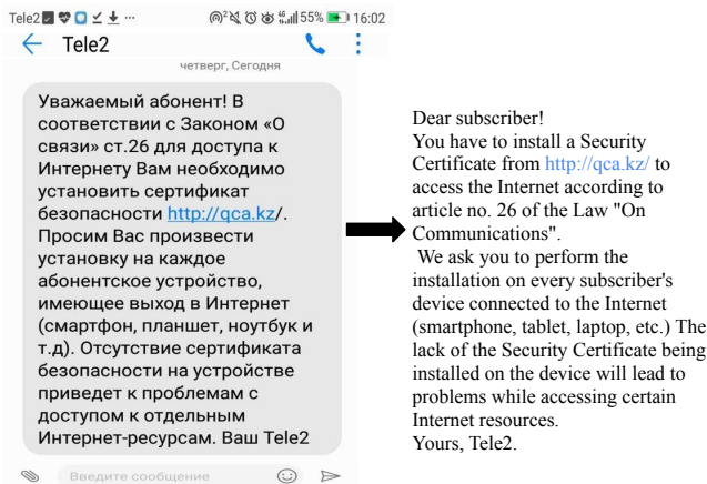
Figure 1: Kazakh users were directed to install a “security certificate”—a custom CA used to intercept HTTPS connections to popular sites. ◊

the browser remembers which certificates belong to each domain after first use, was adopted by major browsers in the past but is no longer supported [34]. Far more successful has been Certificate Transparency (CT) [28], which records certificates in a public ledger so that misissuance is at least detectable; Chrome now requires certificates from public CAs to be logged to CT. However, since the Kazakhstan attack involved users manually installing a custom CA, none of these proposals would prevent it.