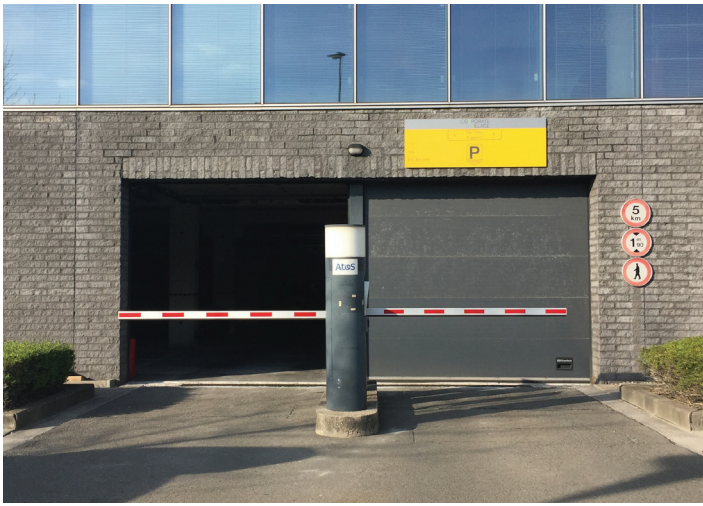
Entrance Parking Lot