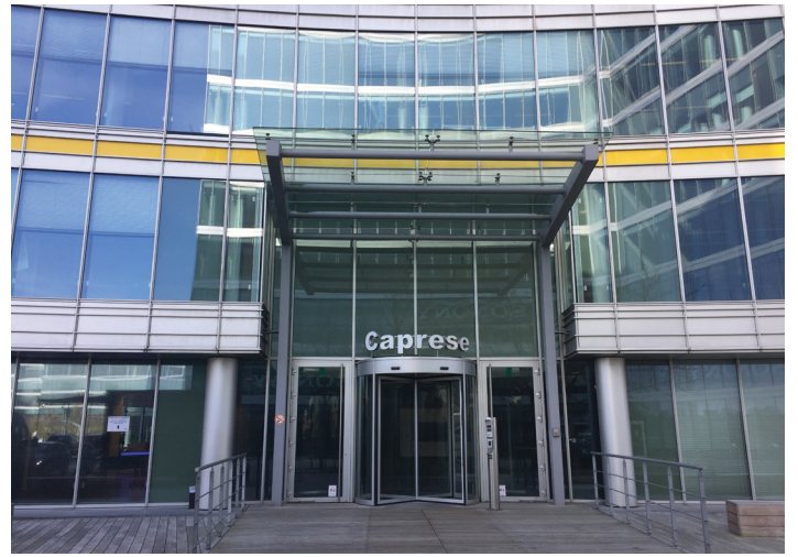
Entrance Caprese Building