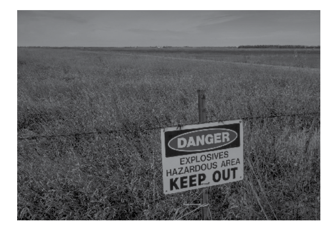
Our series "Bombs in Our Backyard" uncovered the various ways in which the U.S. military is the country's most dangerous polluter.

gative Reporters and Editors Award for freedom of information. The " Trump Town " news app, tracking ex-lobbyists and D.C. insiders who have been appointed across the federal government, was recognized on the Data Journalism Awards shortlist.