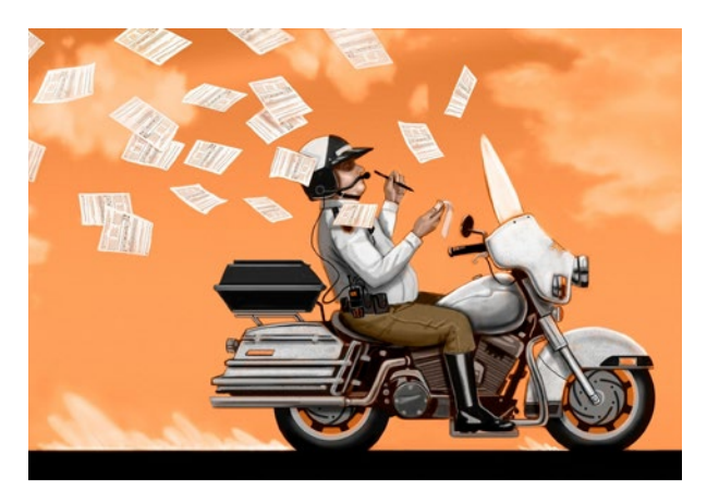
After our story showed pedestrian tickets are disproportionately issued to black residents of Jacksonville, Florida, local lawmakers called for the suspension of pedestrian ticket writing.