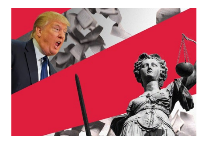
Our podcast project with WNYC, "Trump, Inc.," examines the relationship between Donald Trump's presidency and his business empire.

The series unfolded with detailed stories about rampant casino money-laundering rule violations by the Trump Taj Mahal in Atlantic City. It pointed to the many red flags surrounding the Trump Organization's projects in India, where corruption is common in the real estate industry. It looked at how the Trump family's businesses are suing local governments across the United States, claiming it owes less in property taxes. And it produced a deep-dive into the background of Trump's lawyer Michael Cohen. Listeners helped the "Trump, Inc." team, providing more than 100 tips for the reporting team to follow.