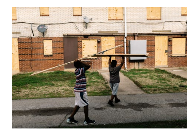
Young residents play with plywood panels, which are used to cover up vacated properties at the Elmwood housing development in Cairo, Illinois.

We feel as if the year has only just begun. We hope you will stay with us for many important stories ahead.