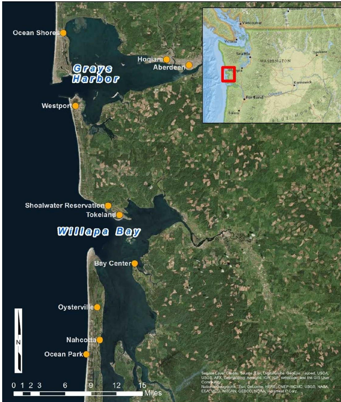
Figure 2.3-1. Willapa Bay and Grays Harbor Location Map

The proposed action would be implemented on commercial shellfish beds in Willapa Bay 4 and Grays Harbor, 5 Washington. These large estuaries are located in Pacific County and Grays Harbor County, respectively, on the Pacific Ocean coast in southwest Washington (see Figure 2.3-1).