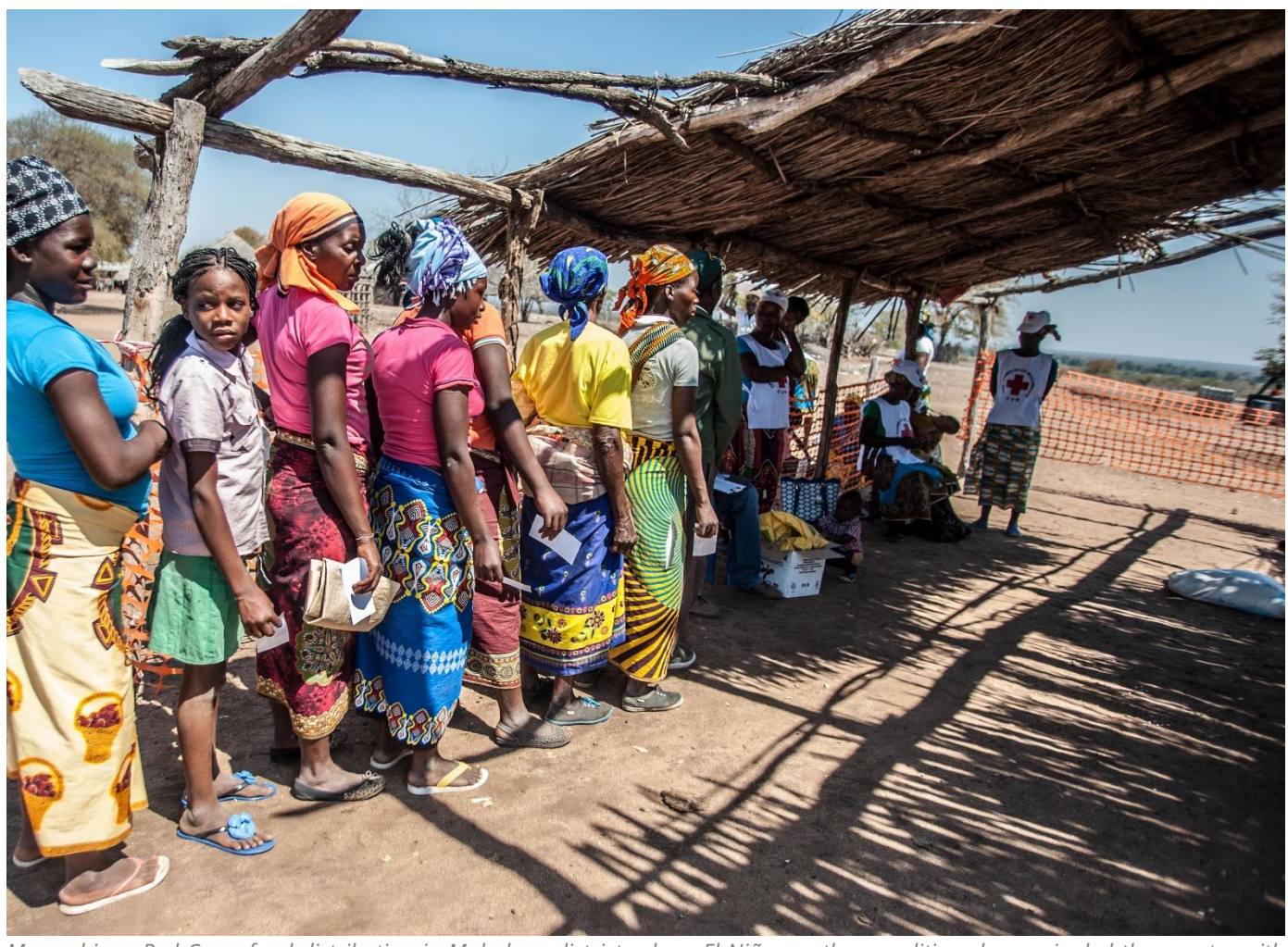
Mozambique Red Cross food distribution in Mabalane district, where El Niño weather conditions have crippled the country with severe drought resulting in failed crops and increased hunger.