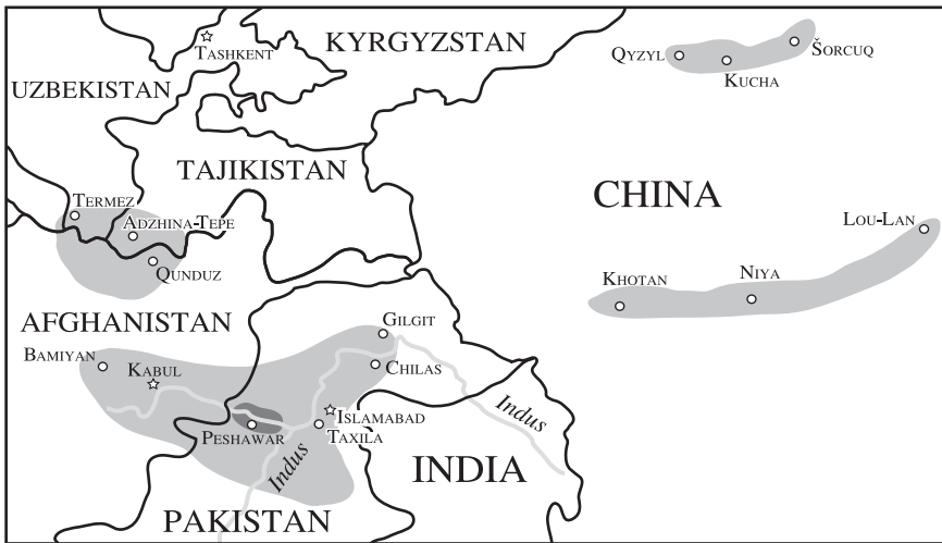
Figure 14-2. Geographical Extent of the Kharoshthi Script

The exact details of the origin of the Kharoshthi script remain obscure, but it is almost certainly related to Aramaic. The Kharoshthi script first appears in a fully developed form in the Aśokan inscriptions at Shahbazarhi and Mansehra which have been dated to around 250 BCE. The script continued to be used in Gandhara and neighboring regions, sometimes alongside Brahmi, until around the third century CE, when it disappeared from its homeland. Kharoshthi was also used for official documents and epigraphs in the Central Asian cities of Khotan and Niya in the third and fourth centuries CE, and it appears to have survived in