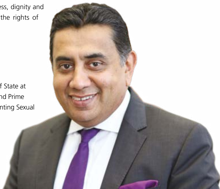
Lord Ahmad of Wimbledon , Minister of State at the Foreign and Commonwealth Office and Prime Minister's Special Representative on Preventing Sexual Violence in Conflict

In the aftermath of a conflict, meaningful peace, reconciliation and justice cannot be achieved if a vulnerable population is excluded from access to life-saving support, family and community belonging. We must reject false, stigmatising narratives about the identities of children born of sexual violence. A child born of war is a child like any other, with the uniqueness, dignity and rights this entails. It is time to act for the rights of children born of war.