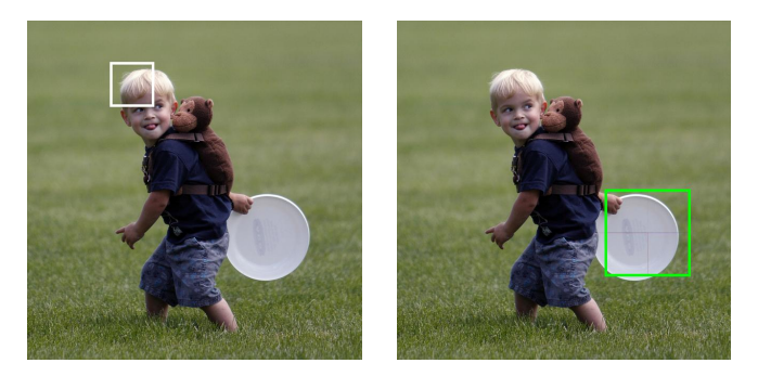
(a) a young boy holding a frisbee in his hand

In this paper, we present a novel attentional mechanism by allowing the model to attend to areas as a whole. An area contains one or a group of items in the memory to be attended. The items in the area are either spatially adja-