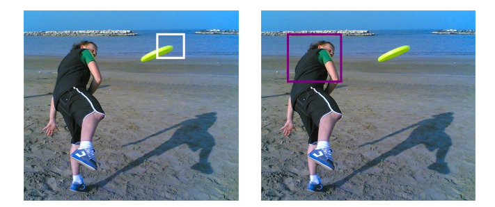
(c) a man on a beach throwing a frisbee

Figure 3: The images on the left show the query grid and the images on the right are attended areas. The top attended area is highlighted with the color of the corresponding attention head.