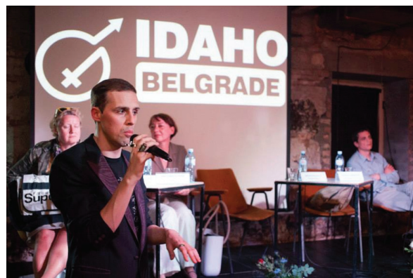
In Belgrade, Serbia activists met for conferences, street art, exhibitions and many more events

Well over 100 events were held in the United Kingdom alone, whilst #IDAHO trended throughout the Day on Twitter UK. Hand-holding flashmobs were organised by young environmental activists across seven cities in Austria and co-ordinated 'rainbowflash' balloon releases were held in more than 10 cities in Germany. Significant international LGBT conferences were held in Luxembourg (four-day multidisciplinary conference on transgender issues), and Croatia (two-day LGBT media conference). Week-long programmes of diverse political and cultural events were organised by grass roots activists in Albania, Bosnia and Herzegovina, Finland, Italy, Lithuania, Moldova, Montenegro and Serbia.