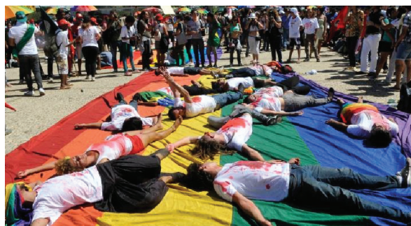
Brazilian activists stage Rainbow Flashmob die-in outside National Congress in Brasília

A truly groundbreaking wave of commemorations marked May 17 in Puerto Rico. Thousands of people took to the streets in various parts of the capital, to take part in a huge festival in favour of LGBT equality. Belize's first lady, Kim Simplis Barrow, released a special May 17 video address affirming her personal and political opposition to Homophobia and Transphobia. May 17 in Cuba was marked by a whole month of events, as well as a massive public celebration, led once again by the President's daughter Mariela Castro. Hundreds of people gathered for events in Haiti, including a conference, film screenings, testimonies and the launch of a new information service for the LGBT community. In Jamaica, a Human Rights Symposium, group statements, blog posts, videos and podcasts, and a country-specific online campaign by Amnesty International marked May 17, amongst other initiatives.