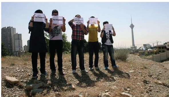
One of a series of photographs taken and shared online from Tehran, Iran on May 17