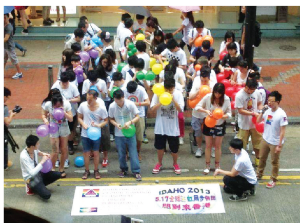
Activists prepare for Global Rainbow Flashmob action in Hong Kong

Dance and musical flashmobs took place in the streets of Nairobi, Johannesburg, Jakarta, Bangkok, Lima, South Korea, the UK, and other cities. City spaces were covered in rainbow art in Fiji, Australia, Serbia, Portugal and Ireland. Kiss-ins marked the Day in the UK, Germany and Brazil, and rainbow coloured balloon releases lit up more than 25 city skylines, in all world regions. The IDAHO Committee gathered together video and photo contributions from activists in dozens of countries, to create the Global Rainbow Flashmob video which can be accessed through our homepage.