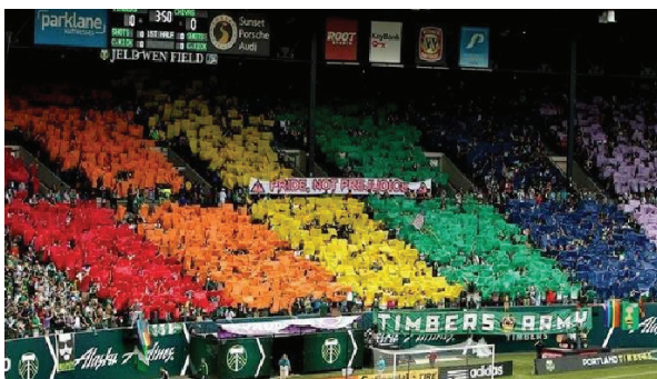
Portland Timbers Football Club, in Canada, organise a Mexican wave in honour of the Day

In the United States, over 15 State representatives commemorated the day through official proclamations and ceremonies. Organisers in California, Illinois, New York, Minnesota, Washington, Georgia, Florida, and D.C hosted activities in commemoration of the Day. US faith leaders convened in Washington, D.C at the National Cathedral to join IDAHO faith events which took place around the world.