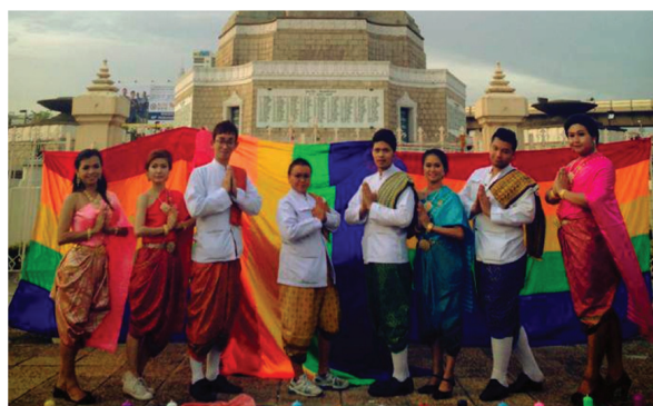
Thailand saw acts throughout the country, including diverse Flashmob actions in Bangkok

In Thailand, workshops and flashmob actions were held in different cities. In Burma/Myanmar, high level seminars and grass roots led public actions were held, involving several thousand participants throughout the country. A month of actions was held around the Day in Vietnam whilst, once again, May 17 commemorations converged with Cambodia Pride Week, with public actions, community-building and capacitation events held in the capital. Parades, marches, flashmobs, conferences, online campaigns, education initiatives, film screenings and community debates marked May 17 across five cities in Indonesia. LGBT communities in the Philippines, Malaysia and Singapore also gathered for events including the launch of a new community safety campaign, the sharing of coming out stories, workshops, photography projects and a book launch.