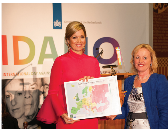
Queen Máxima of the Netherlands at the International IDAHO Forum in The Hague, May 17

The Queen of the Netherlands attended the ceremony on the opening night of the Conference. The ceremony was also attended by high level international political figures, amongst them UN High Commissioner for Human Rights, Navi Pillay, and Vice-President of the European Commission, Viviane Reding.