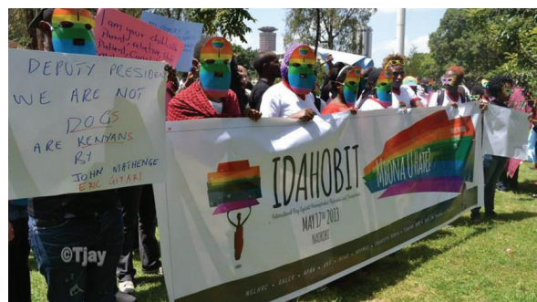
LGBTI communities come together for public actions in Nairobi, Kenya.

activists marked the Day by taking to the streets for their 8th Annual Rainbow Parade. In Lesotho, the country's first ever pride march was held, one year after male homosexuality was decriminalised in the country.