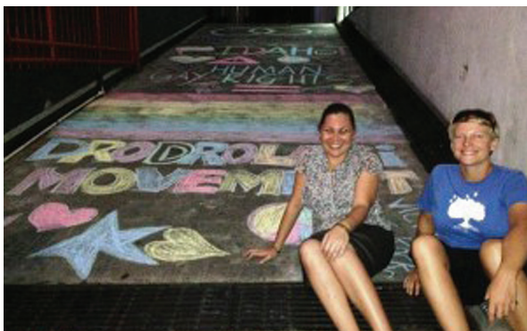
In Fiji, highlights included a special rainbow chalk-in for May 17

Highlights in Australia included a rainbow die-in in Melbourne and the launch of a new anti-homophobia campaign by the Australian Football League Players Association: #Footy4IDAHO. More than 20 events were held around May 17 2013 in the city of Greater Geelong alone, including at 12 schools. Across the country countless new campaigns, texts and products were launched, film and discussion events held, and rainbow flags raised by local authorities.