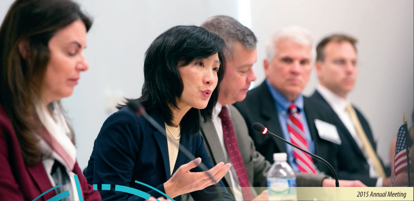
2015 Annual Meeting