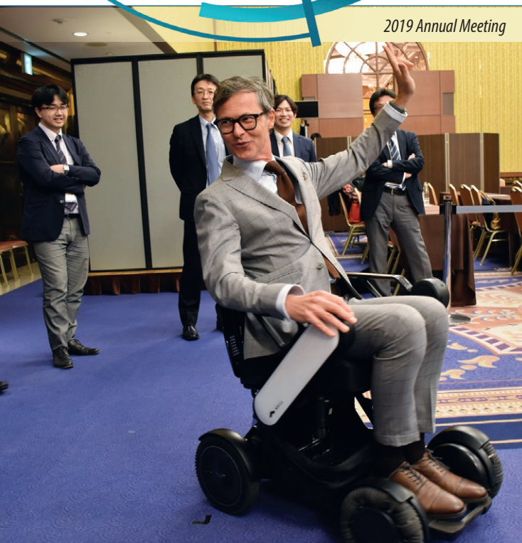
2019 Annual Meeting

All partners implemented WIPO's Digital Access Service (DAS)—an electronic priority document exchange mechanism—for industrial design applications.