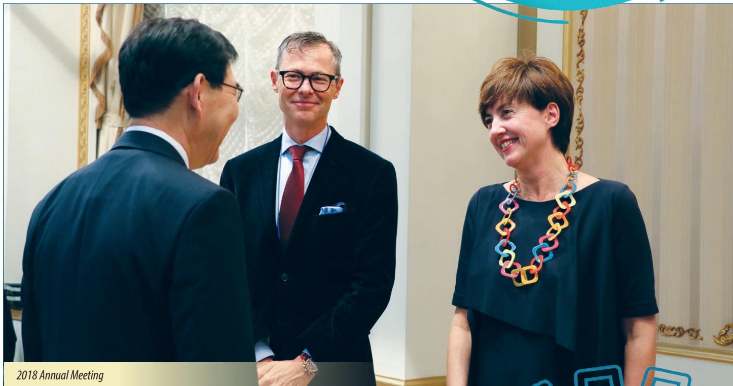
2018 Annual Meeting

ID5 office studies provided information and guidance that partners could rely upon in updating various practices related to industrial design protections.