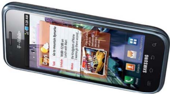
One of the slimmest smartphones on the market, the Vibrant measures just 0.39 inches thin and weighs 4.16 ounces.

While this phone is optimized for use with T-Mobile's high-speed 3G network, many of its functions will also work well on the moderate-speed EDGE network. If you plan to access the Internet extensively on your phone, 3G network coverage may serve you best.