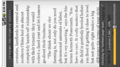
Enjoy your favorite books on the go with Kindle for Android.