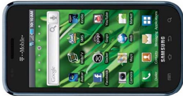
Enjoy on-the-go entertainment with pre-loaded games and video, including The Sims 3 Collector's Edition and Avatar , with a 4-inch Super AMOLED touchscreen display.

Samsung Vibrant handset, rechargeable battery, charger, 2 GB microSD memory card, USB cable, wired stereo headset, quick start guide