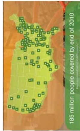
185 million people covered by end of 2010