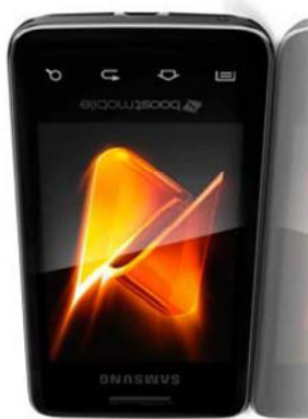
See larger image.