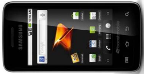
See larger image.