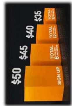
Boost lowers your monthly payment by $5 for every 6 on-time payments ($50 Monthly Unlimited example illustrated above).