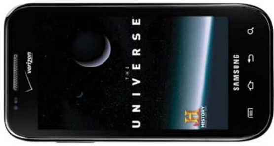
Powered by a fast 1 GHz processor, the Android 2.1 operating system, and fast Verizon Wireless 3G EV-DO data network (see larger image).

At 0.39 inches (9.9mm) thin, the Fascinate is the thinnest Android smartphone on the market, and it packs in a 2 GB internal memory plus pre-installed 16 GB microSD card (with a 5-megapixel camera/camcorder with auto-focus and HD video recording (720p resolution), fast Wireless-N Wi-Fi networking (802.11b/g), Bluetooth 3.0 technology for hands-free devices and stereo music streaming, and just under 6 hours of talk time.