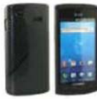
Body Glove 9163602 TPU Case i897 - 1 Pack - Retail Packaging - Black