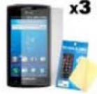
GNWE Three LCD Screen Guards / Protectors for Samsung Captivate SGH-i897