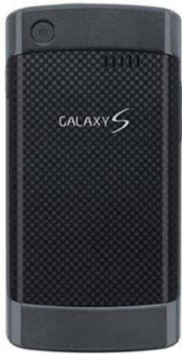
Capture vivid still images and videos with the 5-megapixel camera with 720p HD video recording.