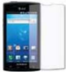
5x Samsung Captivate SGH-i897 Premium Clear LCD Screen Protector Cover Guard Film, no ...