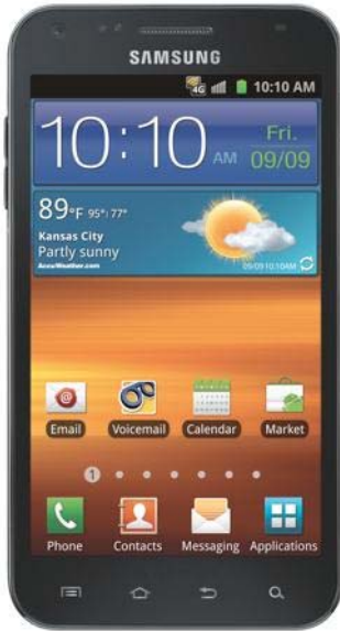
The Samsung Epic 4G Touch with brilliant 4.52-inch Super AMOLED Plus display (see larger image).