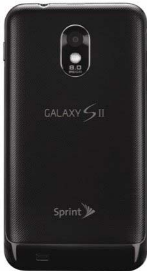
8-megapixel camera on the back with Full HD 1080p video capture.

better graphics. The Super AMOLED Plus display is also razor thin, helping to reduce the overall size of the Epic 4G Touch, and it also helps to reduce power consumption by 18 percent.