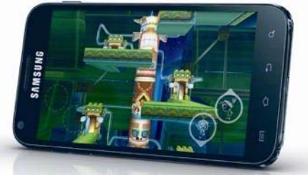
Ultra-fast 1.2 GHz dual-core processor perfect for gaming and viewing HD videos.

Samsung Epic 4G Touch handset, rechargeable battery, charger, USB cable, quick start guide