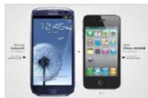
Need Help Choosing a Smartphone or Tablet? Head to Versus IO