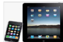
iPhone and iPad Security: 5 Often-Overlooked Settings