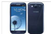
Galaxy S III Local Search Gone: Apple Patents Kill Another Android Feature