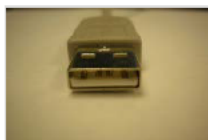
USB Group Approves New One-Size-Fits-All Charging Method