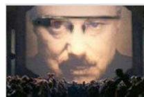
Google Glass Horror Stories From Your Privacy-Free Future