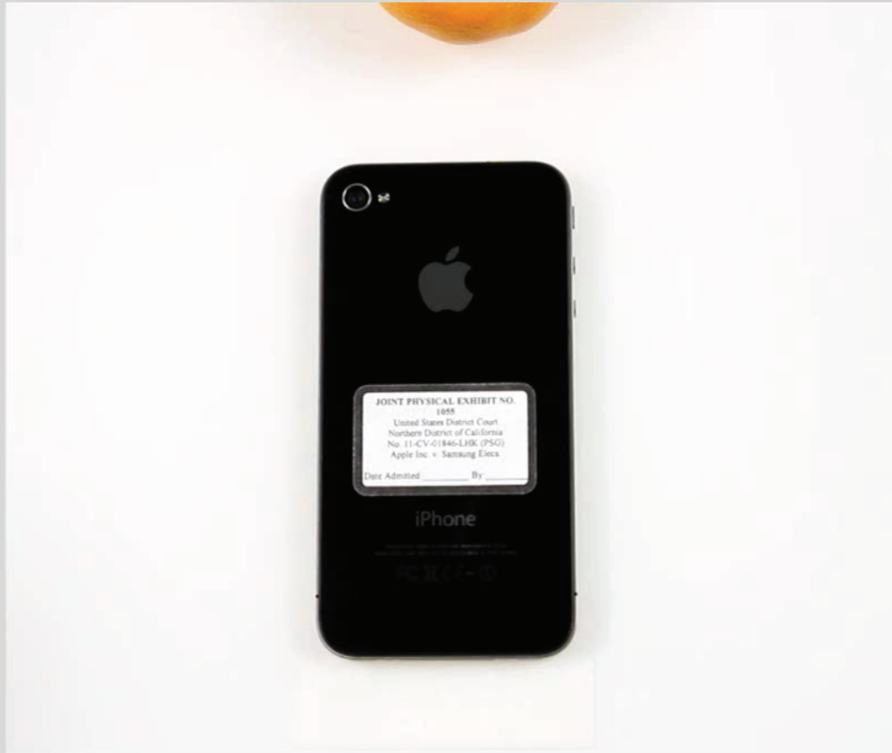
iPhone 4 - JX1055