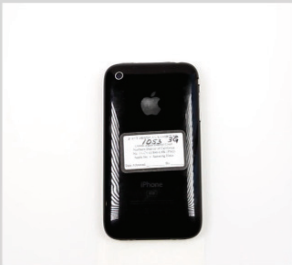
iPhone 3G - JX1053