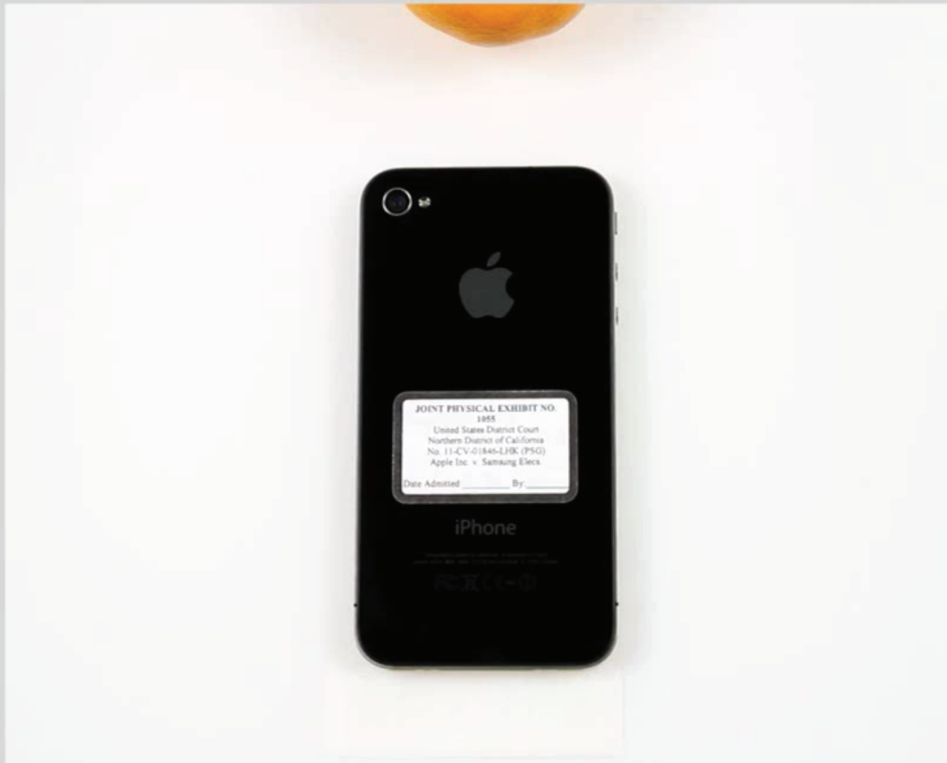
iPhone 4 - JX1055