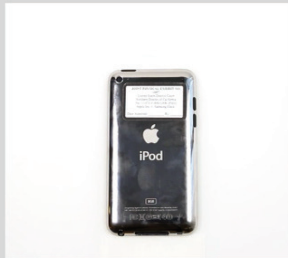
iPod Touch - JX1057