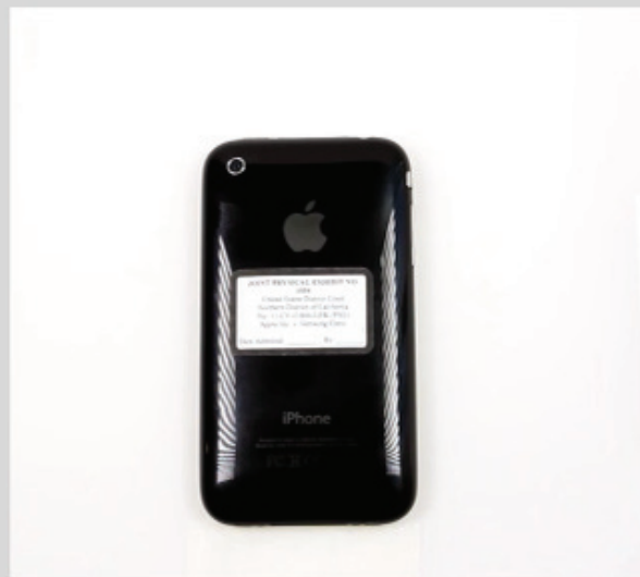
iPhone 3GS - JX1054