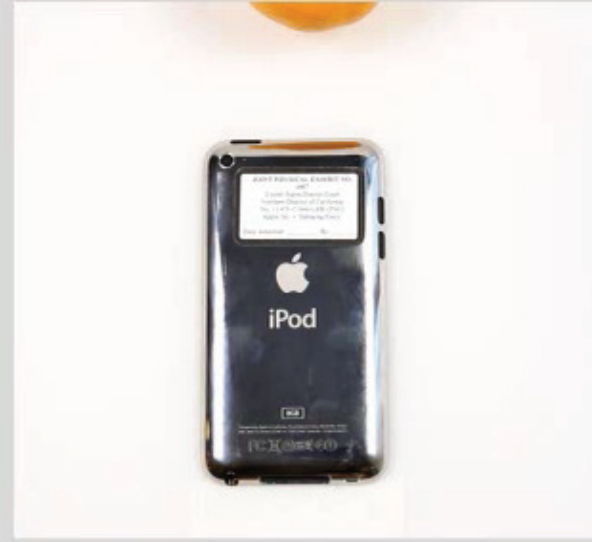
iPod Touch - JX1057