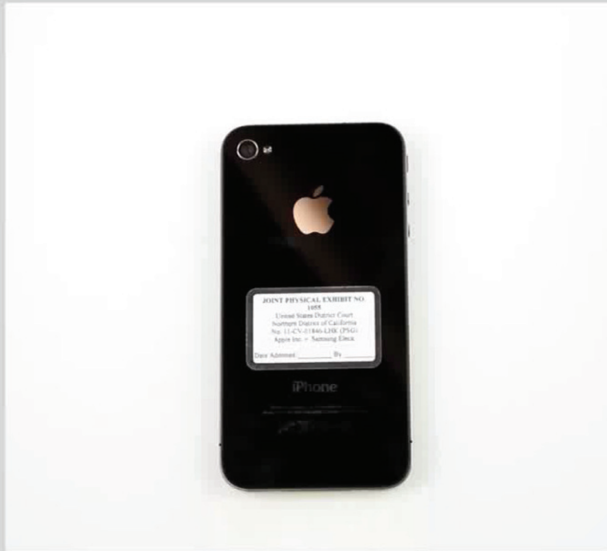
iPhone 4 - JX1055