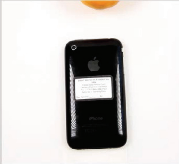
iPhone 3GS - JX1054