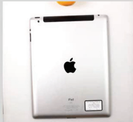
iPad 2 3G - JX1050