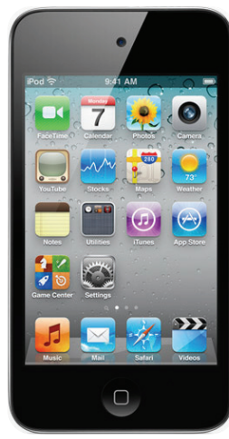
iPod Touch 4 th Gen