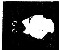
Fig. 1.2: The new Linux 2.0 logo.

The installation of Linux 2.0 offers new possibilities too. Kernel modules (drivers which are loadable when the system runs) are supported in a logical manner, as well as a so-called "initial ramdisk". This makes required modules available after the start of the kernel and makes it possible to start the system directly after the installation without rebooting.