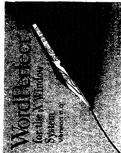
Fig. 1.3: Word Perfect for Linux.

LST Software GmbH The development of LST is being continued by LST Software GmbH in Erlangen, Germany and POWER LINUX is based on Caldera OpenLinux Lite, the freely available version of Caldera OpenLinux.